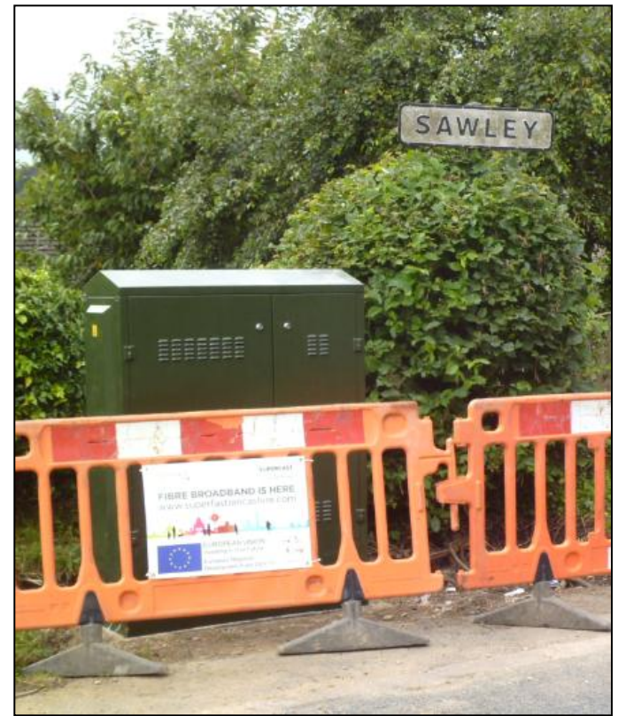
Cabinets in the villages of Chatburn and Sawley, in the process of build.