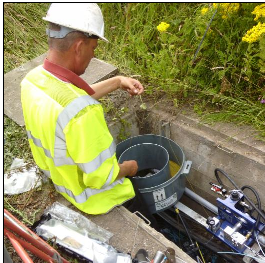
Fibre distribution network splicing in Blackburn