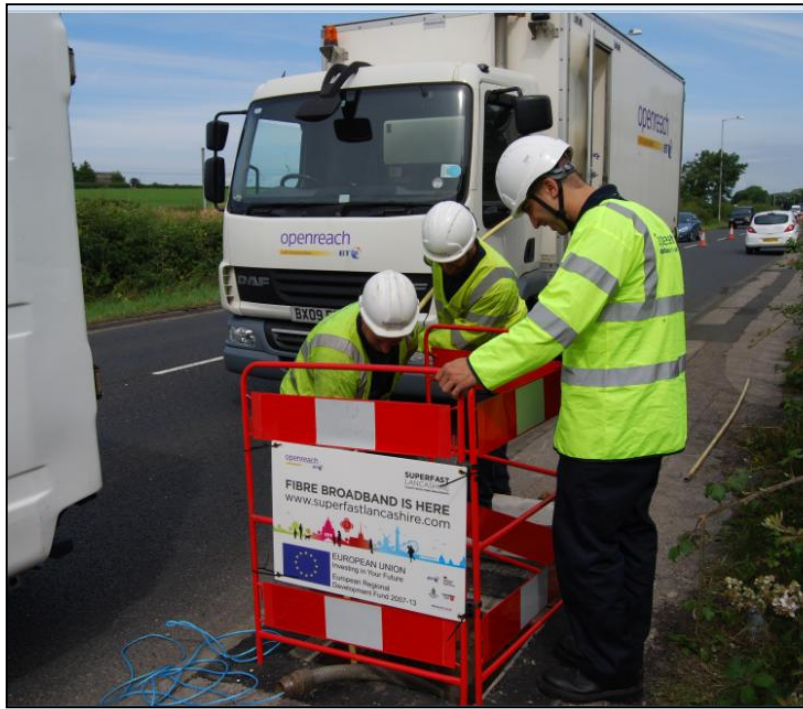
Openreach engineers working on the fibre spine network between Lancaster and Galgate.